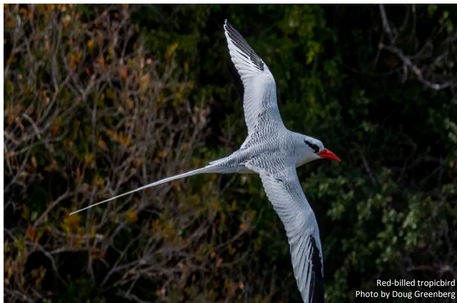
Red-billed tropicbird