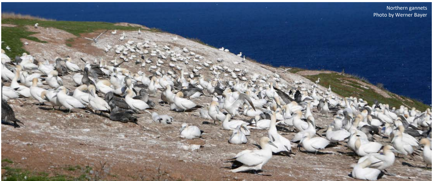
Northern gannets