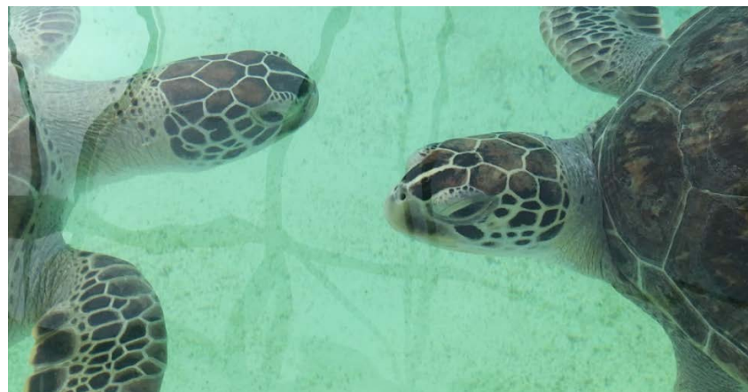
Green sea turtles (Angela Sunley, Texas General Land Office).

impending closure of an existing rehabilitation facility. The project would expand regional rehabilitation coverage on the upper Texas coast. The estimated total cost of the project is $10,500,000. The Texas TIG would provide $2,500,000 of the total estimated costs.