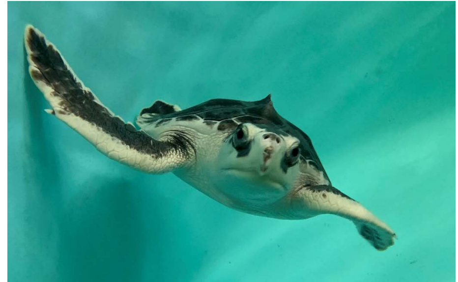
Sea turtle undergoing rehabilitation (Gulf Center for Sea Turtle Research - Texas A&M University at Galveston).