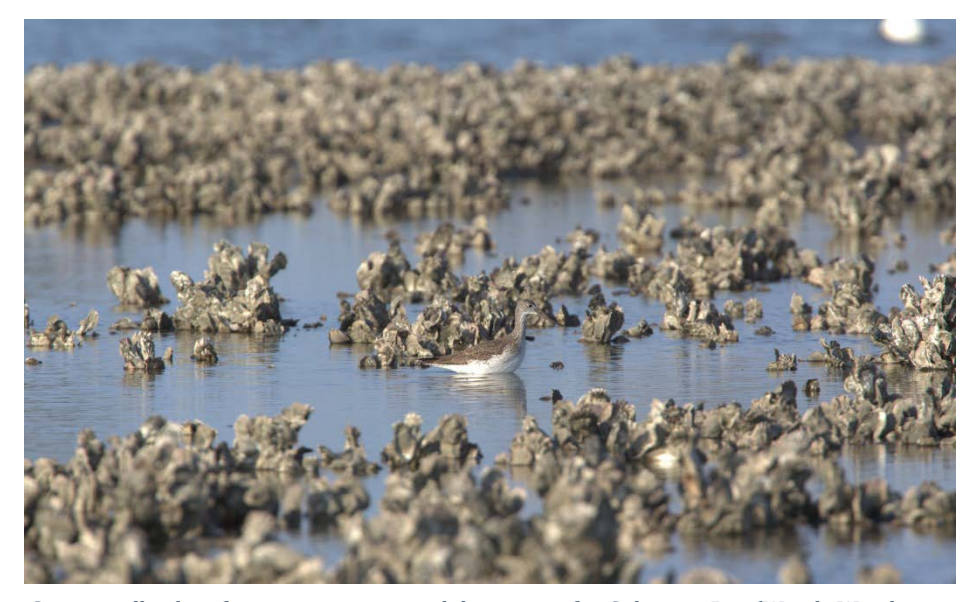
Greater yellowlegs foraging on an intertidal oyster reef in Galveston Bay.