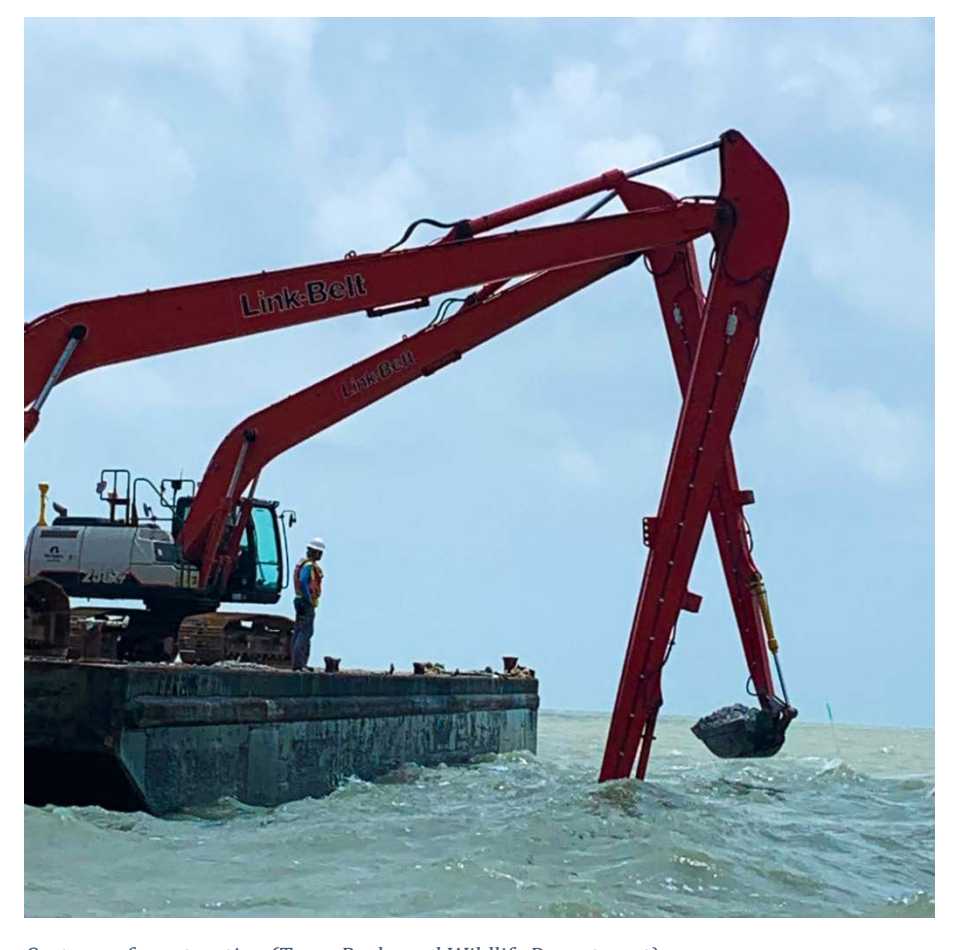
Oyster reef construction.

For additional project information, please see the Draft Restoration Plan/Environmental Assessment #2: Restoration of Wetland, Coastal and Nearshore Habitats; Nutrient Reduction; Oysters; Sea Turtles; and Birds online at www.gulfspillrestoration.noaa.gov/restoration-areas/texas.