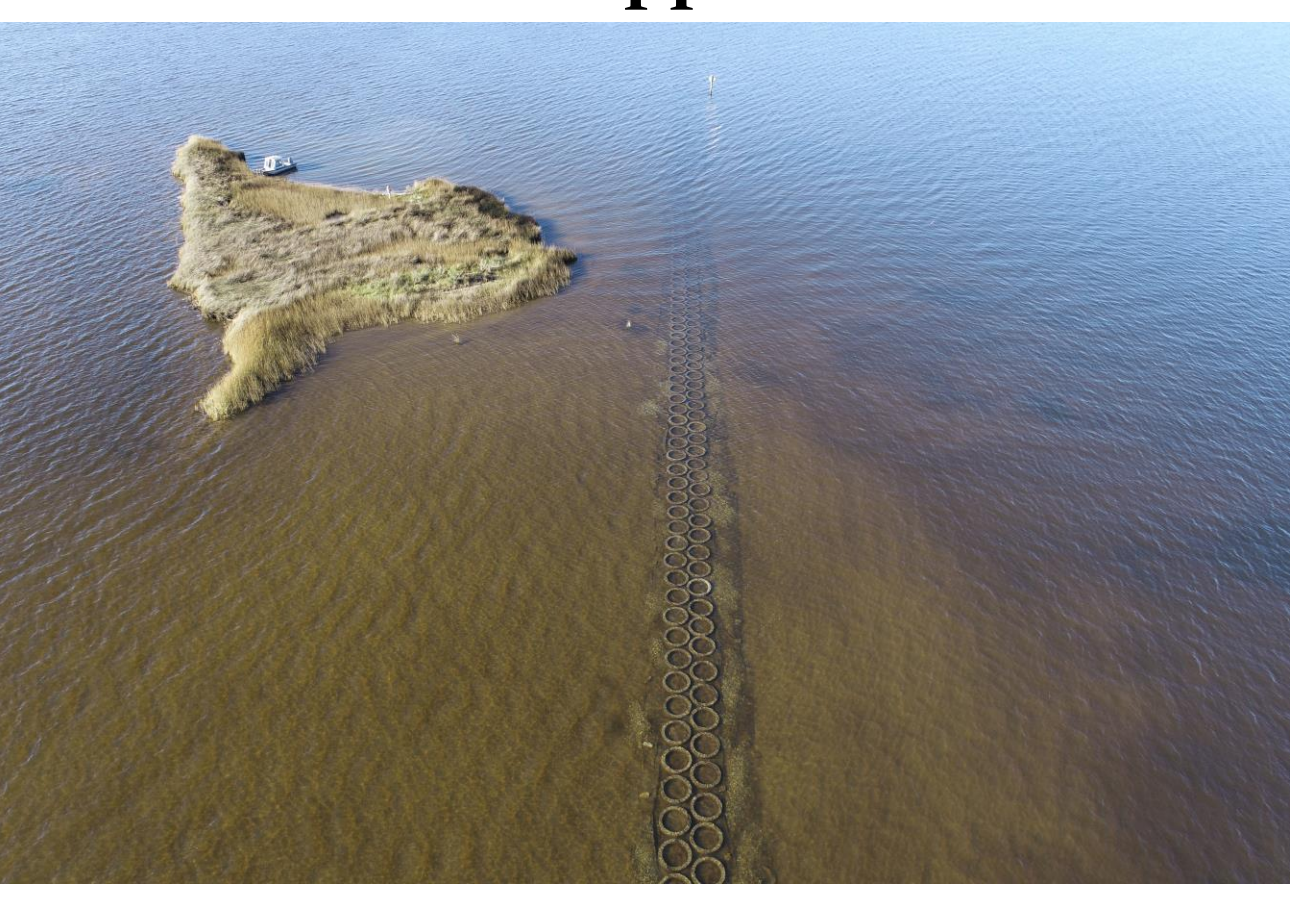
Wolf River Living Shoreline and Subtidal Reef