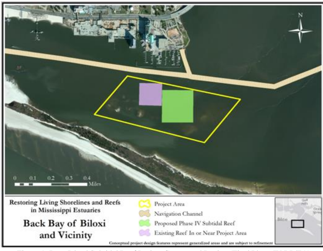
Figure 1: Deer Island Subtidal Reef Project Conceptual Design (Final Phase IV RP/EA)