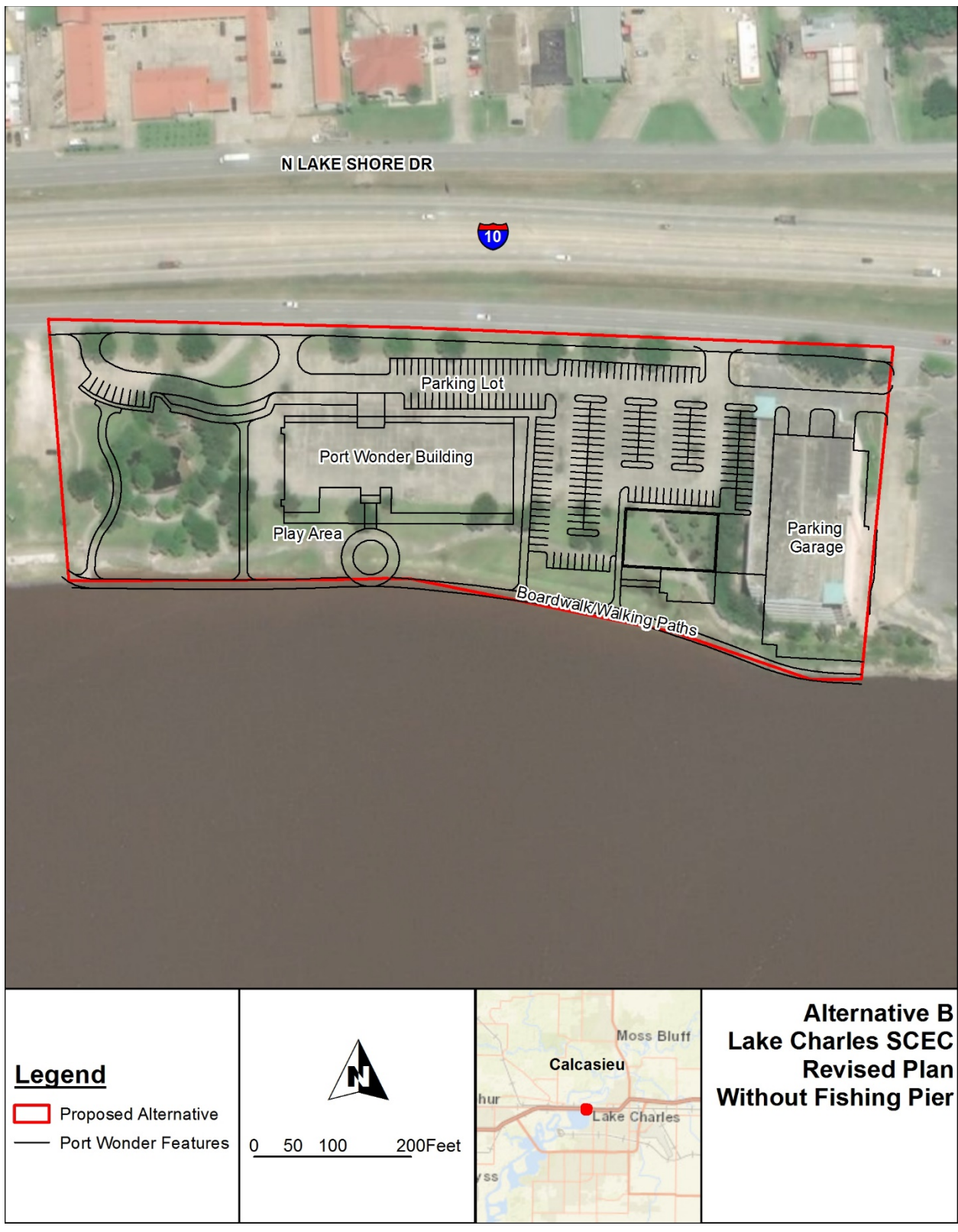
Figure 2-3. Alternative B: Revised Location without Fishing Pier.