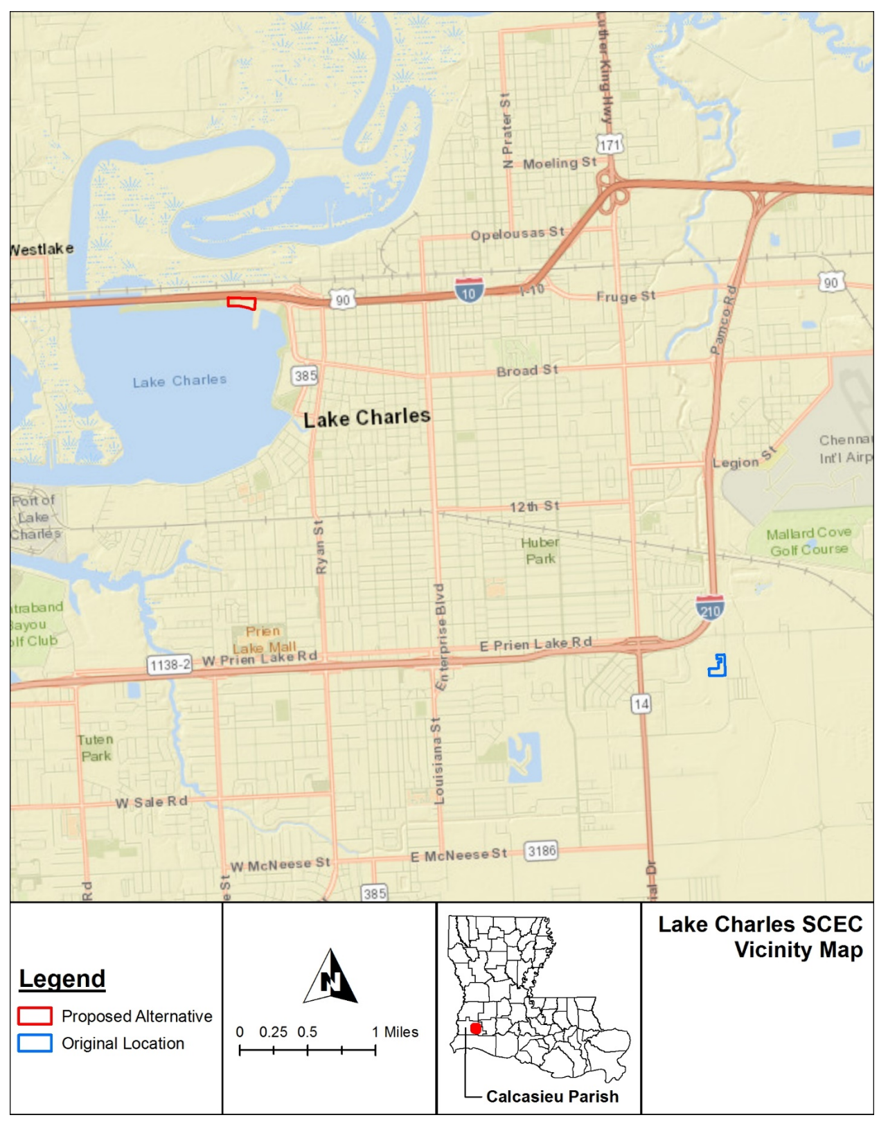
Figure 2-1. Lake Charles SCEC alternative locations.