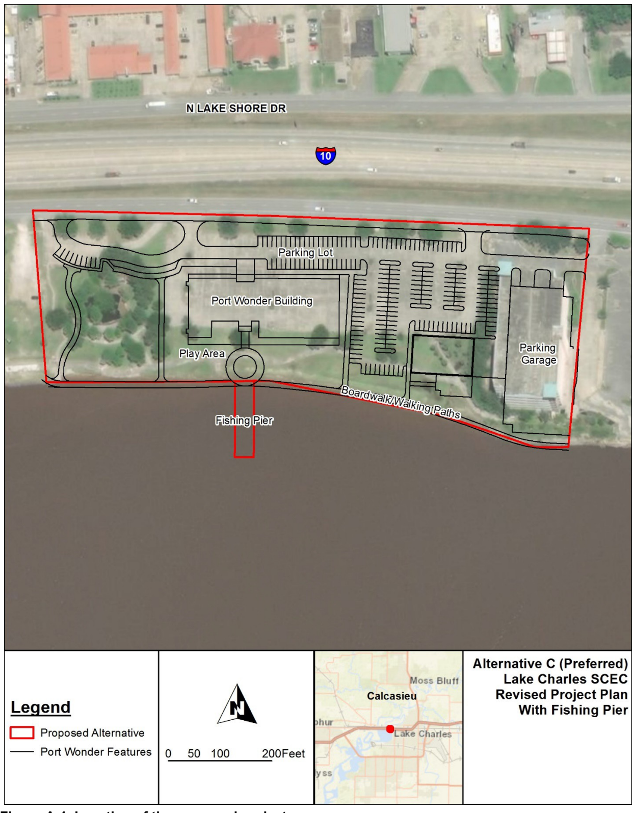
Figure A-1. Location of the proposed project.