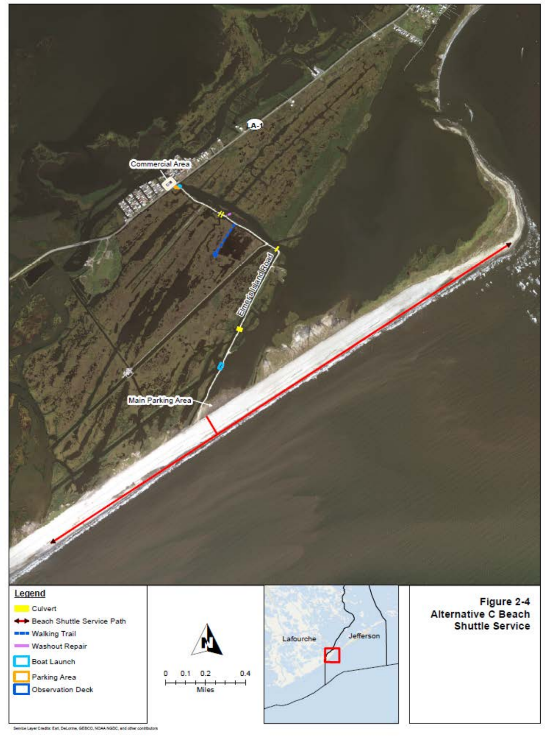
Figure 2. Preferred Modification to Project Scope (Shuttle Service)